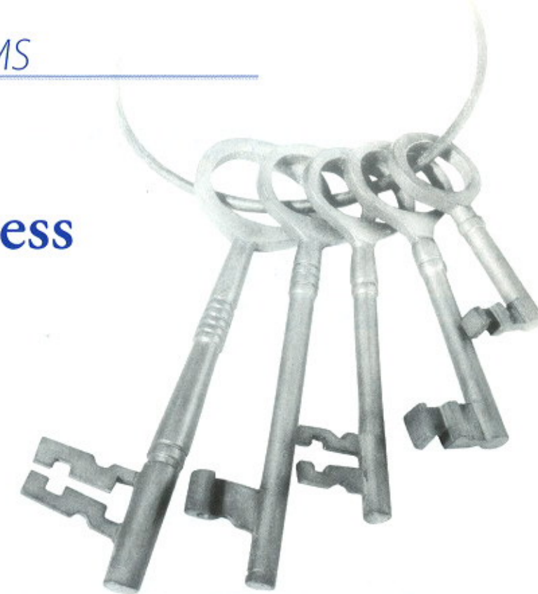
AMS Levels and Contracts for 2005:

The new Agency Management System provides a clear-cut career path for those who want to get into Management. AMS will also provide for more people choosing leadership opportunities thereby adding more recruiting power to build and increase Agency growth. With more people stepping up into Management, this in turn will allow for more opportunities for career Agents. The Agency Management System is a state of the art program where everyone benefits — Agents, Managers, policyholders, and the Company.